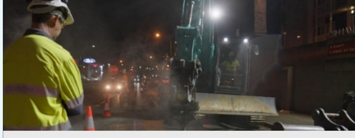
Night works to install new infrastructure at a busy Launceston intersection