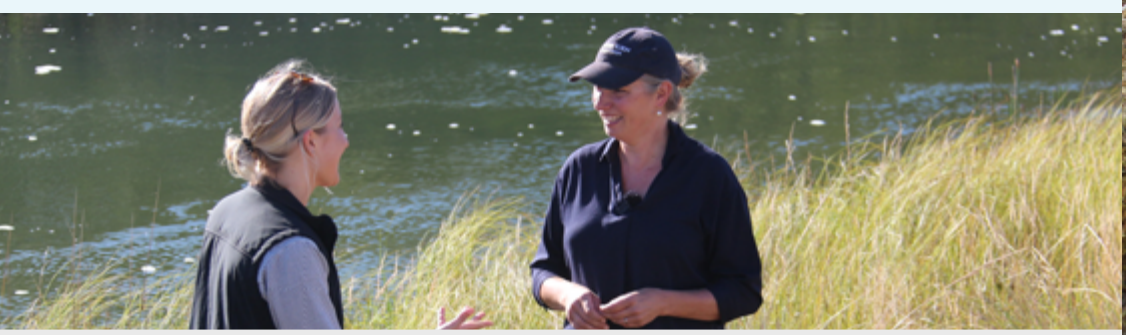
Watch these videos, visit nrmnorth.org.au

NRM North recently created a series of videos to further promote the Tamar Action grants available to eligible farmers.